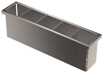
Stainless steel perforated tray 8151 004