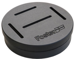
Knives-holder 8100 030